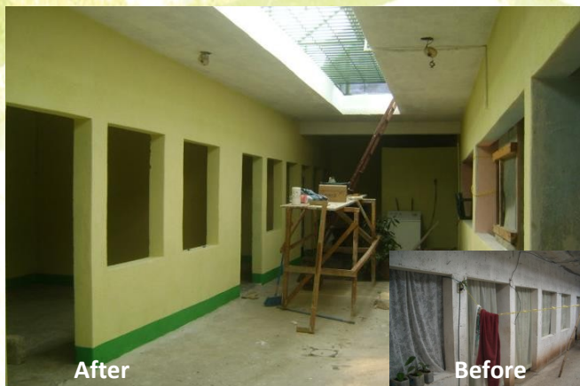
Remodeling of Courtyard and Classrooms