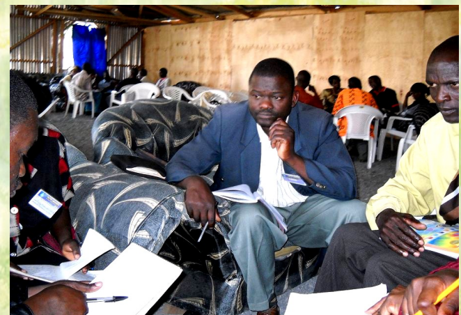
Empowering the People in Africa

Let me preach you without preaching, not by words, but by my example, by the catching force, the sympathetic influence of what I do, the evident fullness of the love my heart bears to you.