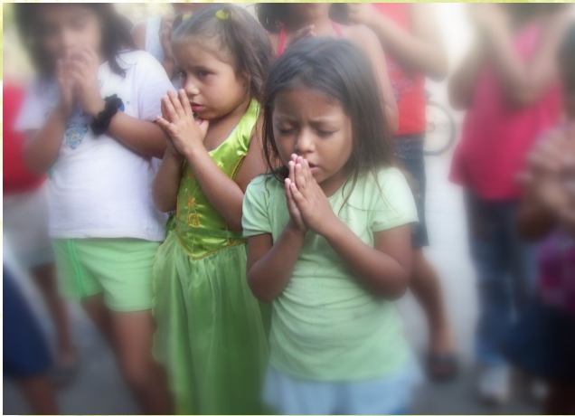
Children Crying Out To God