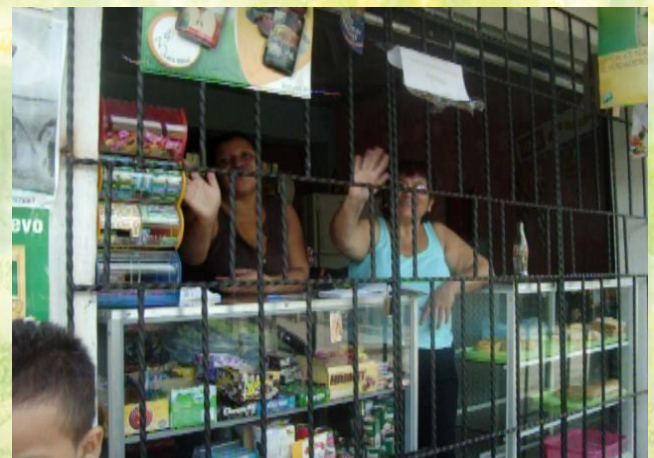
Community Store - Guatemala

Let me preach you without preaching, not by words, but by my example, by the catching force, the sympathetic influence of what I do, the evident fullness of the love my heart bears to you.