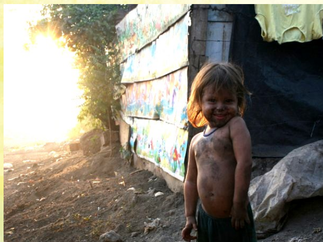
Feeding the Hungry