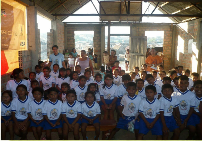
Our Children with their new uniforms