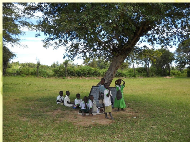
School in Kenya, Africa