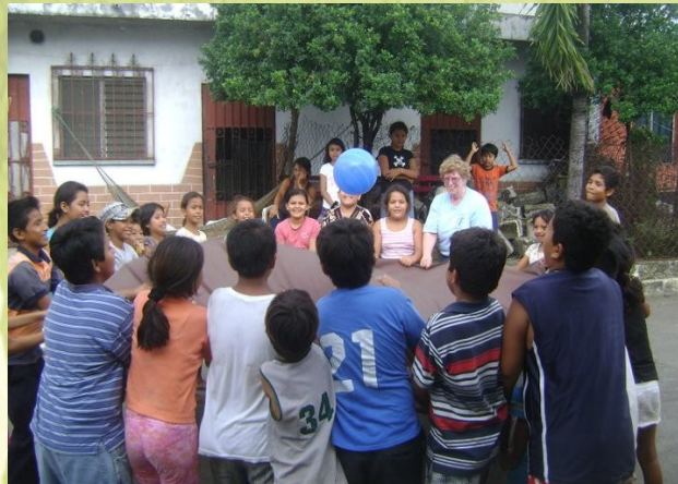
Mission Activities In July