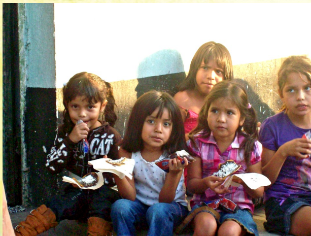
Street Outreach in Guatemala