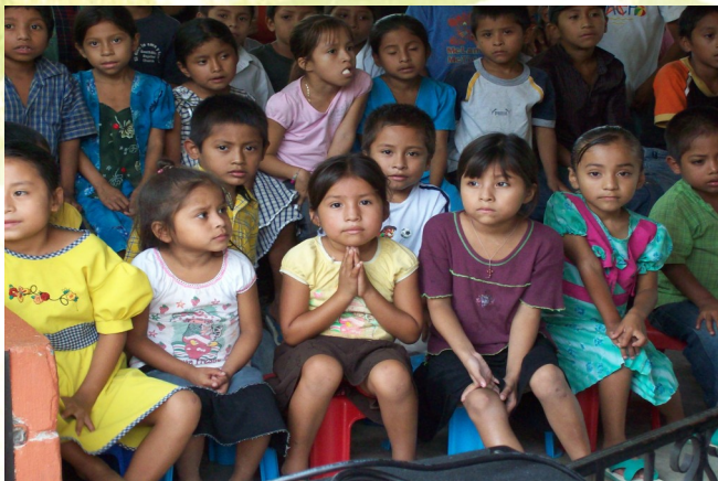
Mission of Hope - Chiquimula, Guatemala