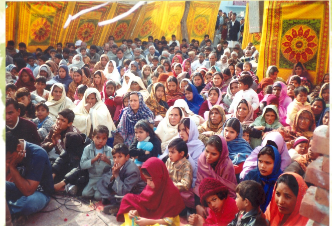
Evangelism in Pakistan