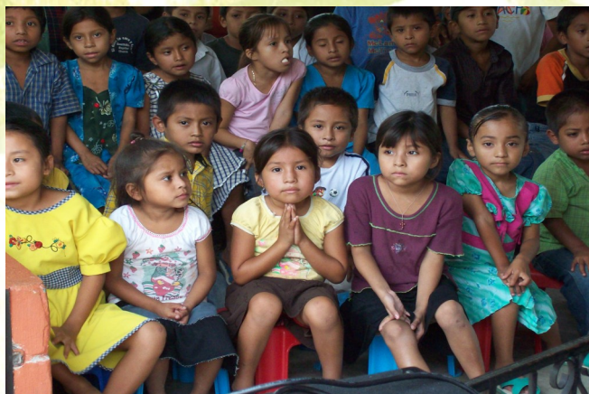
Mission of Hope - Chiquimula, Guatemala