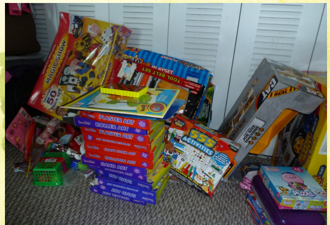
Gifts Donated By Compassion People