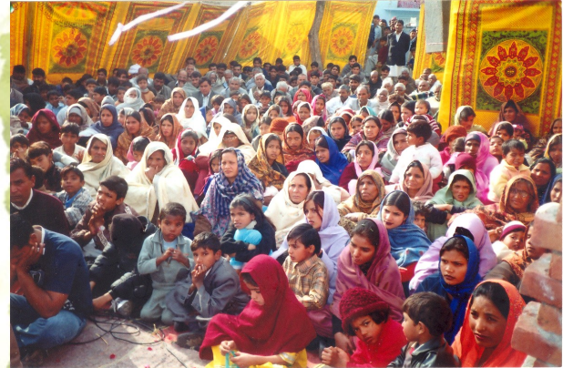
Evangelism in Pakistan