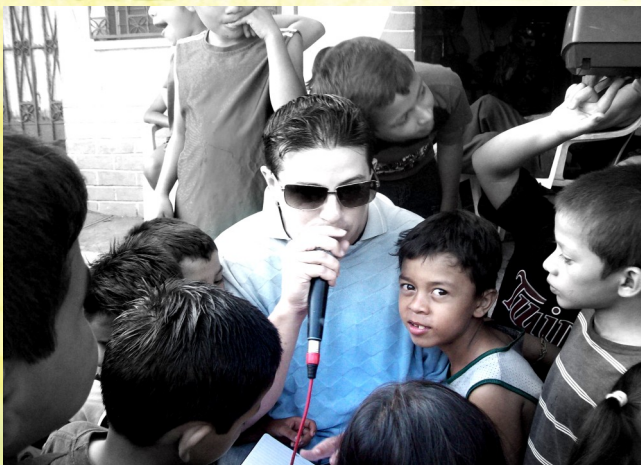
Street Outreach in Guatemala