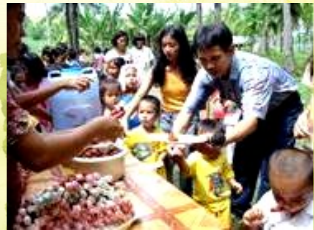
Feeding Children in the Philippines