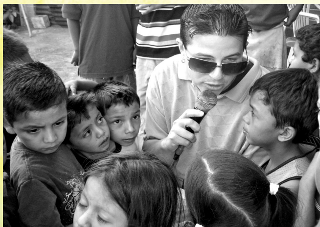
Street Outreach in Guatemala