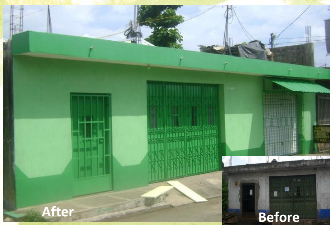
Completing the Center Remodeling