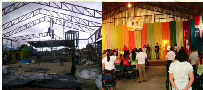
Before and After Pictures of Construction of Church in Costa Rica