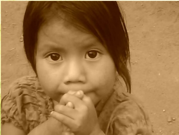
Eyes are Windows to the Soul