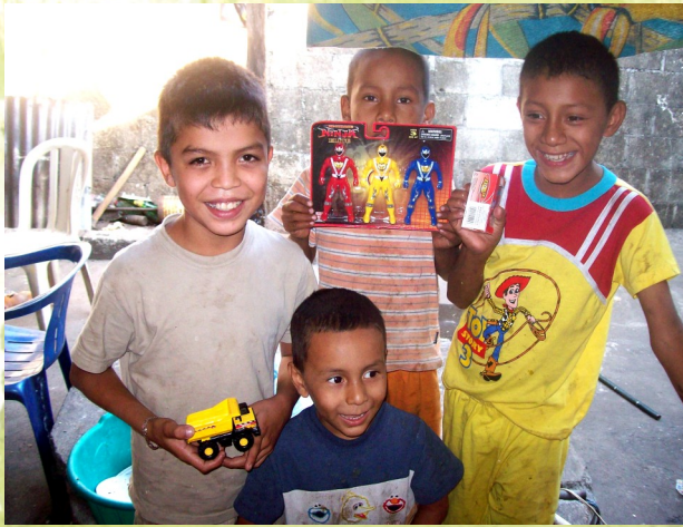
Giving is Better Than Receiving