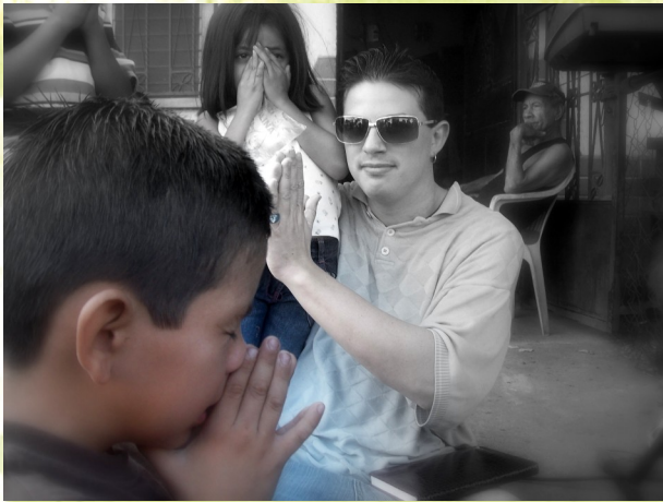
Children Crying Out To God