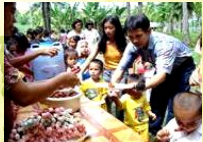
Feeding Children in the Philippines