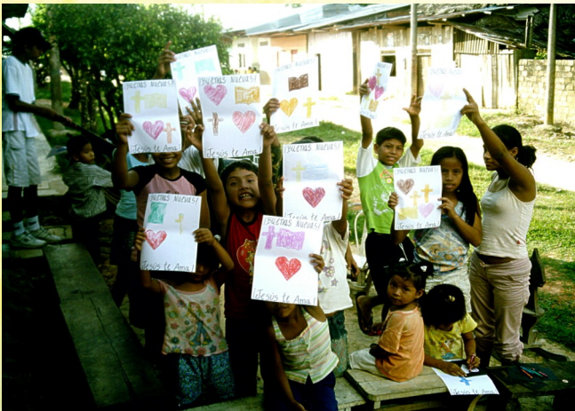
Teaching the Children