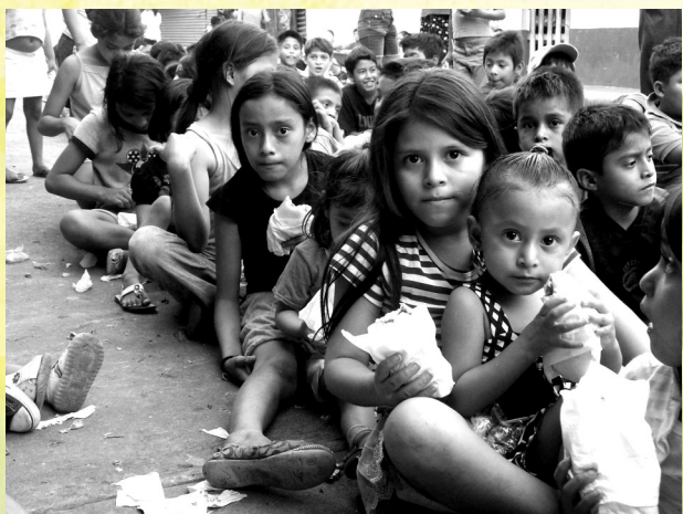
Feeding the Hungry