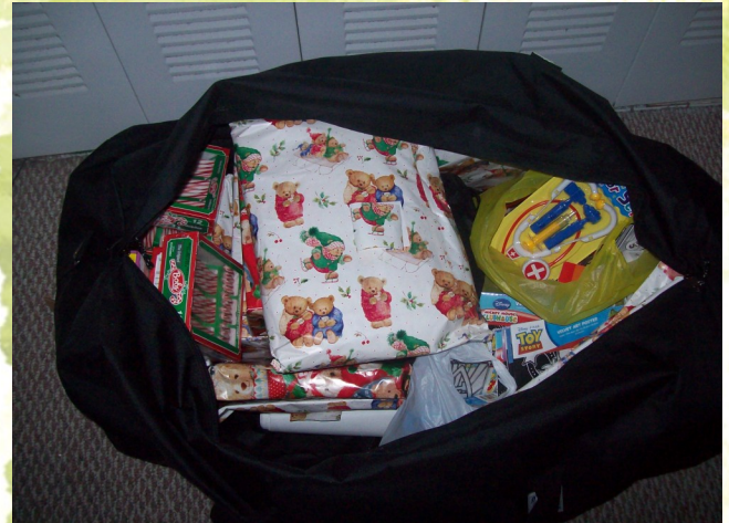
Donations Prepared for Shipment