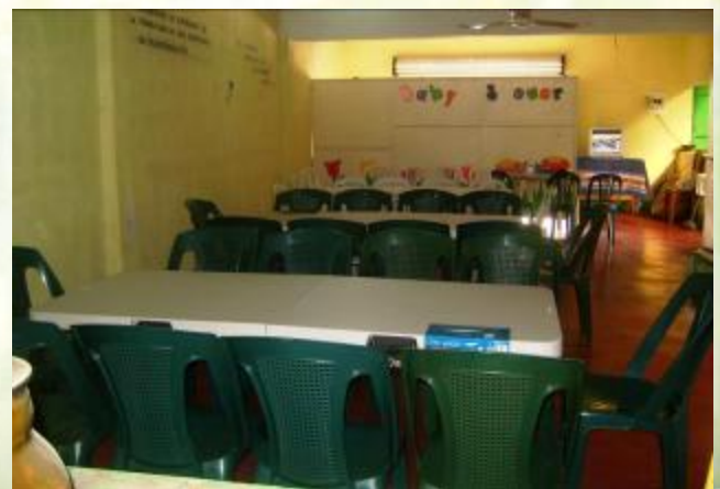
New tables donated for our center

Let me preach you without preaching, not by words, but by my example, by the catching force, the sympathetic influence of what I do, the evident fullness of the love my heart bears to you.