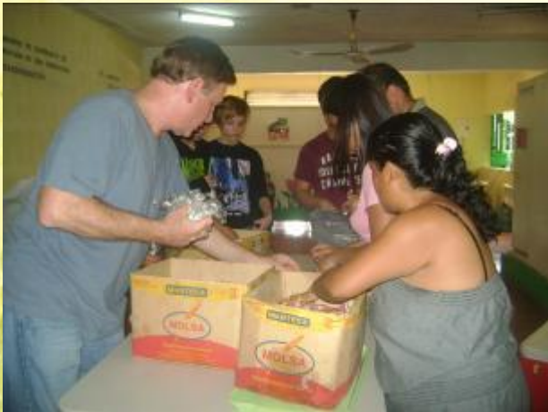
Volunteers preparing food