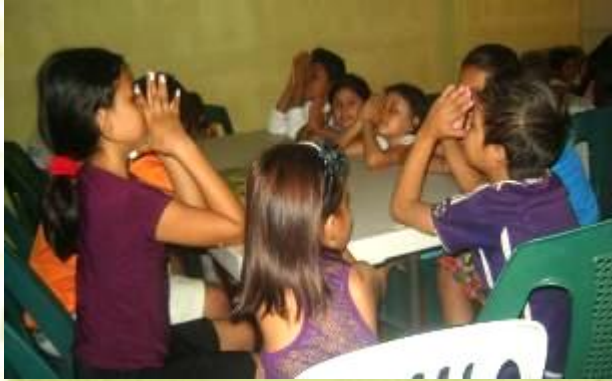
Prayer before a meal