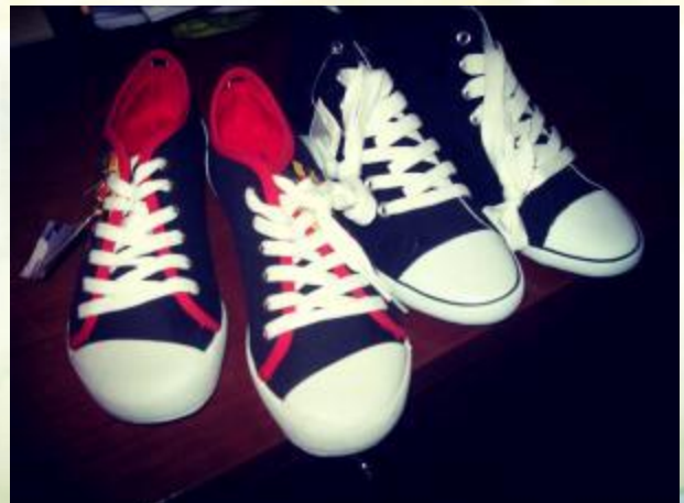
New shoes donated for the children

You Can Help Us Help These Children By Adopting-A-Center for Only $5 Monthly.