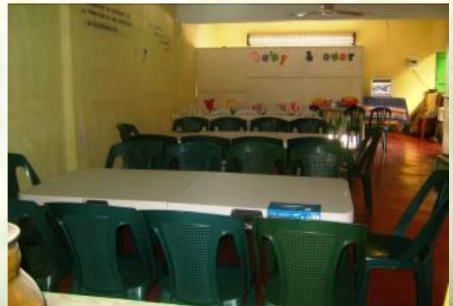
New tables donated for our center

Let me preach you without preaching, not by words, but by my example, by the catching force, the sympathetic influence of what I do, the evident fullness of the love my heart bears to you.