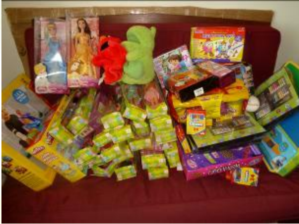
Toys donated for our children this past Christmas