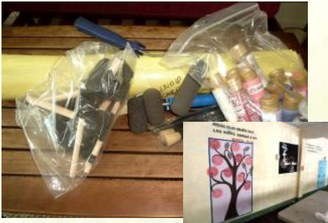
Paints, brushes and stencils donated by Theresa Fronius at Wall to Wall Stencils to create a beautiful atmosphere in our center