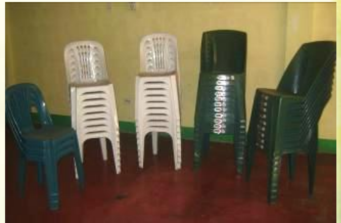
Chairs donated by the Church of Genesis Youth Group

You Can Help Us Help These Children By Adopting-A-Center for Only $5 Monthly.