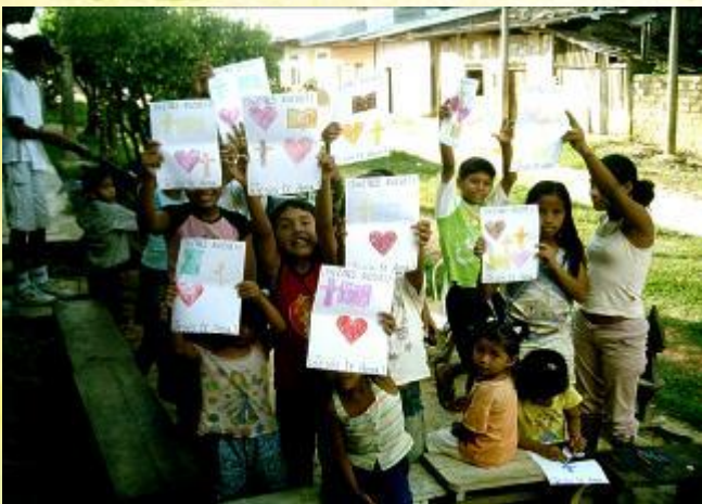
Teaching the Children