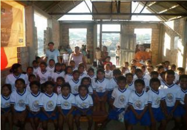
Our Children with their new uniforms