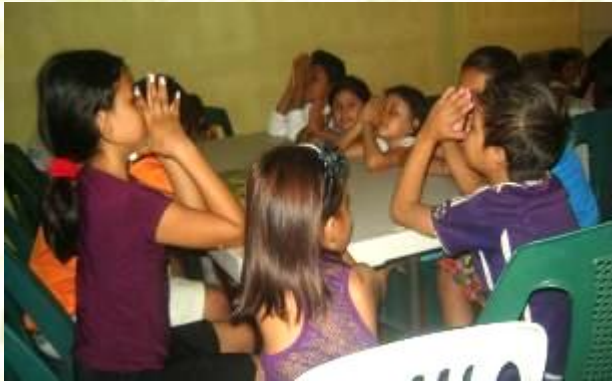
Prayer before a meal