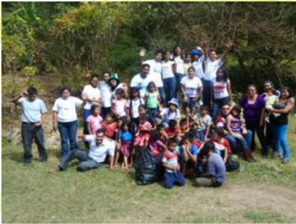
Mission in San Juan Sacatepéquez