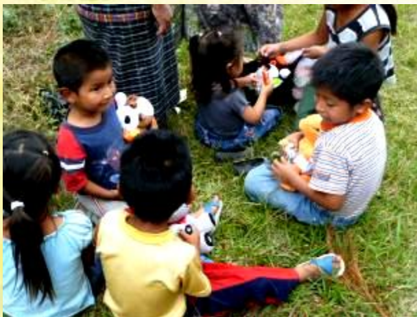
Giving toys and clothing to the children