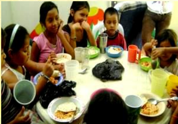
Street Outreach in Guatemala