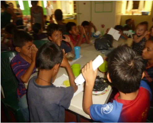
Prayer Before Feeding Over 80 Children

Formation of a Generation of Transformation