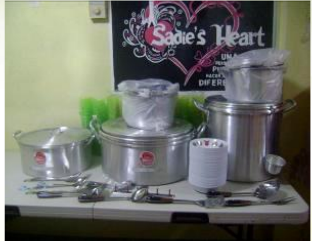
Donation of Kitchen Supplies for Feeding Center