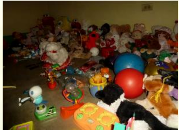
Gifts Donated By Guatemalans for Christmas