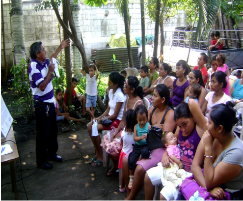
Providing Family Values Classes