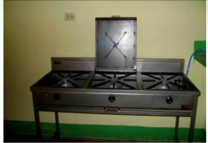
Donated Stove for Feeding Center