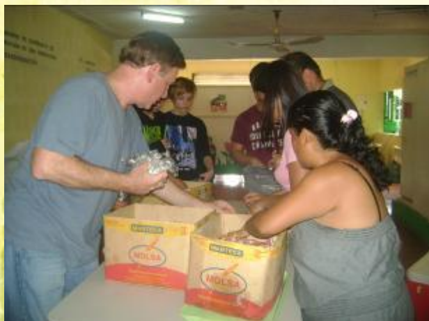
Volunteers preparing food