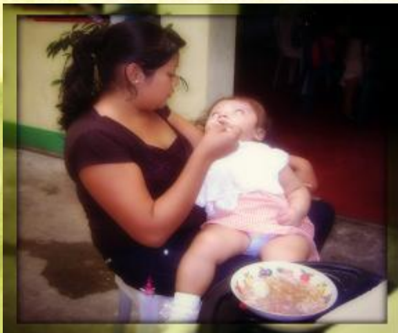
Receiving food from our feeding center