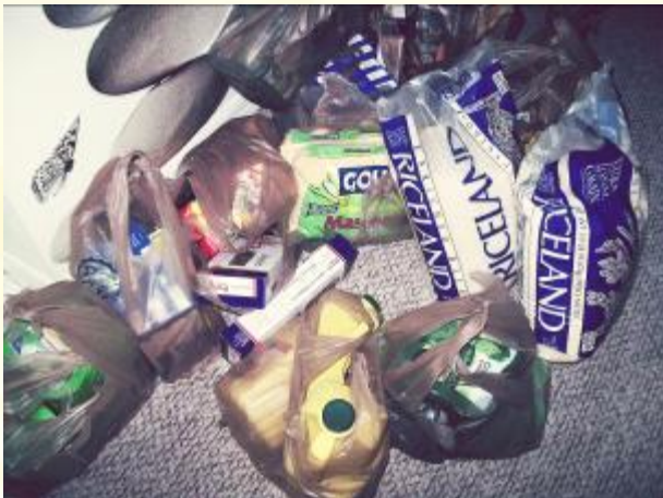
Food donated by a precious donor who has a deep passion to help the children.